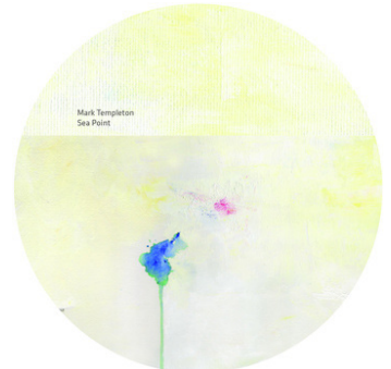
Sea Point Anticipate 007A Released: August 2009 Format: limited 12 inch/mp3