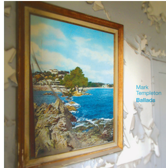
Ballads Released: July 2010 Format: CD, limited edition of 100