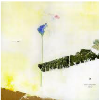
Inland Anticipate 007 Released: May 2009 Format: CD/mp3