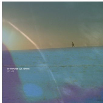
Acre Loss Anticipate 009 Released: February 2009 Format: CD + DVD/mp3