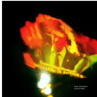
Scotch Heart Sweat Lodge Guru SLG022 Released: March 2011 Format: Cassette, limited edition of 100