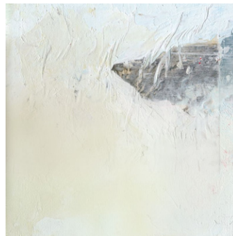
Standing On A Hummingbird Anticipate 001 Released: February 2007 Format: CD/mp3